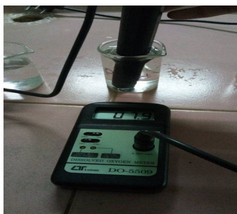
Figure-2 : DO Test in Laboratory