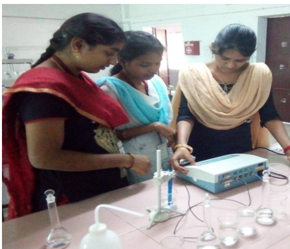
Figure-2: pH Test in Laboratory