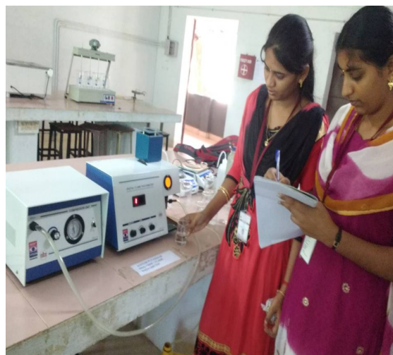
Figure-3: Sodium, Potassium, Calcium by Flame photometer Test